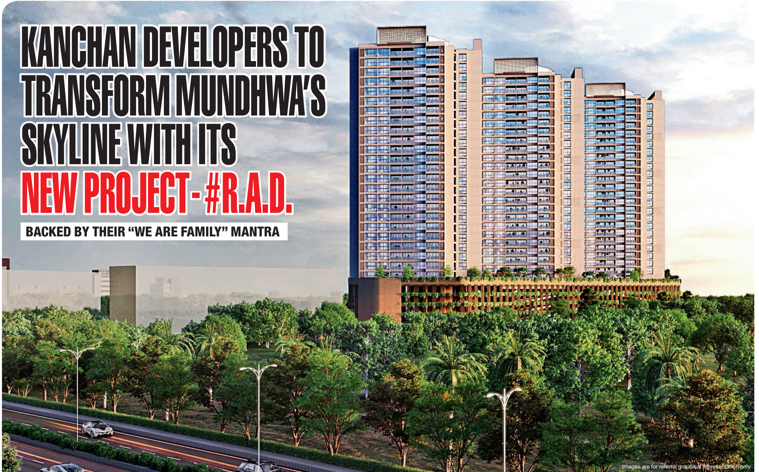
Images are for referral graphical representation only

Pune has emerged as a powerhouse in the Indian real estate market, showcasing a 45% surge in housing unit sales from 2019 to 2023, culminating in a record 89,347 units sold in CY'23. The total value of homes sold in Pune last year reached an unprecedented ₹57,412 cr., the highest in the past five years. Notably, the 70 lacs to 1 cr. and 1 to 2 cr. segments witnessed over 250% growth, reflecting the city's burgeoning demand for premium housing.