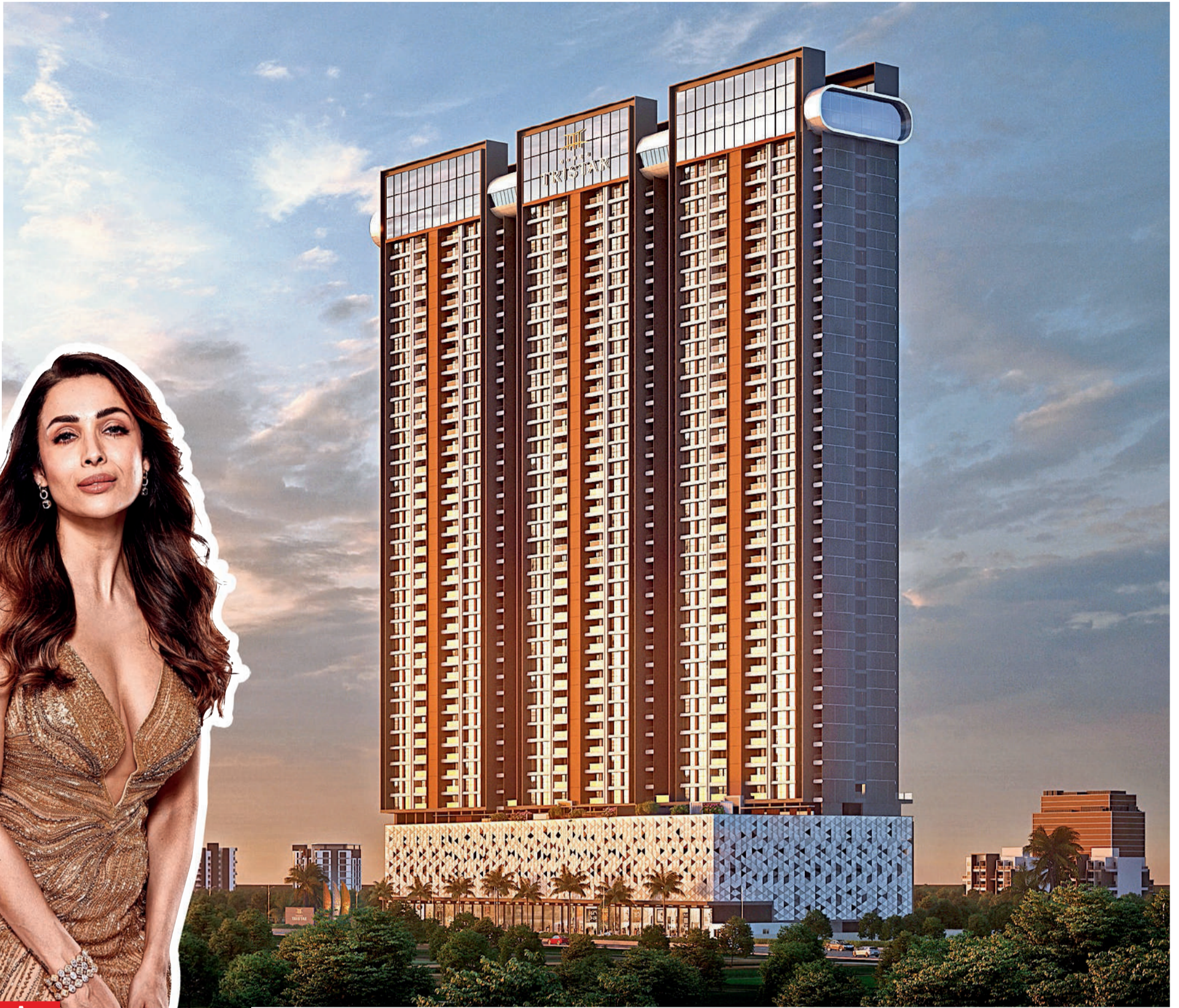
Images are for referral graphical representation only